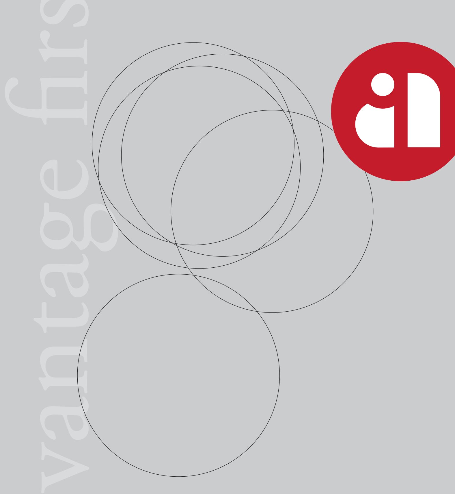
advantage first insurance services